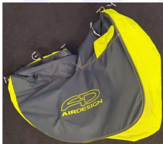
Reference paragliding harness: AirDesign Le Slip